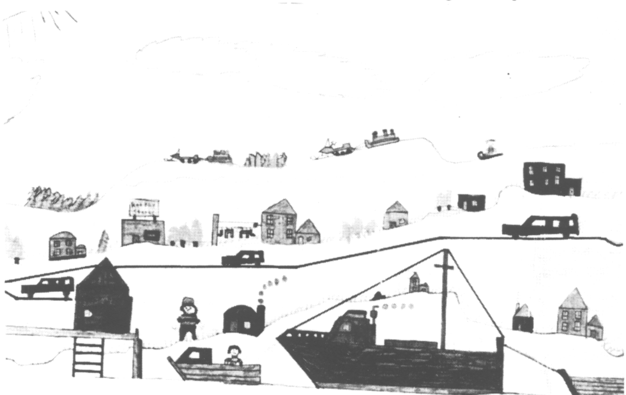
Paul Hillyard, Red Bay Integrated All-Grade, Red Bay, Grade 4 "Untitled"