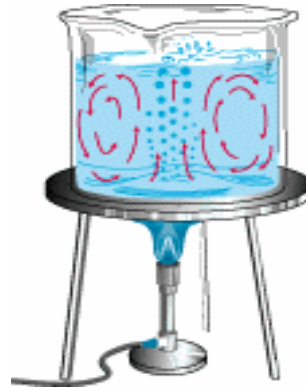
Figure 2: Convection currents in boiling water

Procedure: Students will observe the motion of rice as the water is slowly boiled. Ask them to compare their observations to the motion of magma in the Earth's mantle. Students should recognize that these hot spots are analogous to plate boundaries.