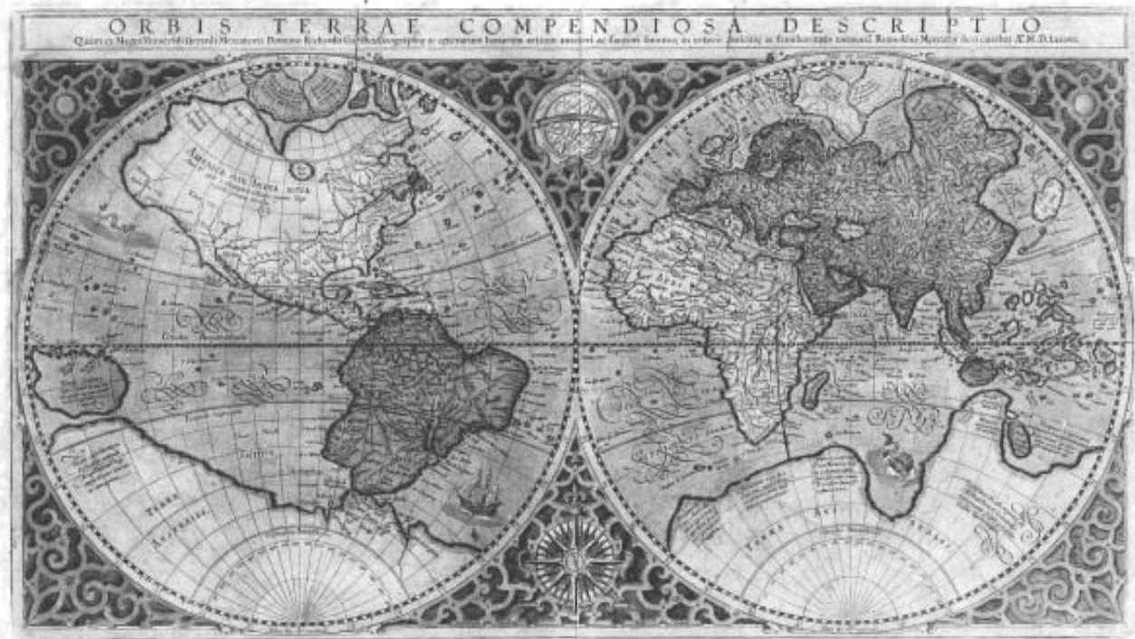
World view after the discovery of the Americas. Mercator, 1587