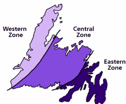
Figure 1: Geological subdivisions of Newfoundland.

It is no accident that this island of Newfoundland is such a wonderful place to find marine fossils! The Western Zone represents the eastern edge of the old North American continent and the Eastern Zone represents the western edge of Africa. Using fossil and mineral evidence, scientists have shown that the western edge of Africa was once attached to the Avalon Peninsula. The Iapetus Ocean lay between what is the present day Central Zone. About 500 million years ago, tectonic forces squeezed the Eastern Zone towards the Western Zone pushing up our present day Appalachian Mountains on the west coast of the island and giving rise to the Central Zone.