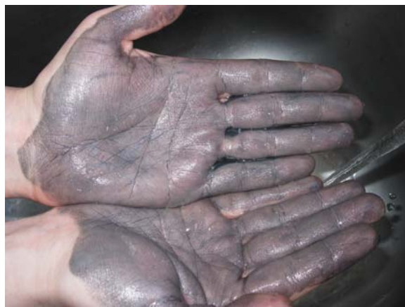
Cleaning snowmobile grease from your hands using water is highly problematic.

People rarely experience problems with cleaning substances such as mud and clay from their clothes and bodies since both are soluble in water and therefore, can be cleaned off. To the contrary, people often experience problems with cleaning substances such as oil and grease from their clothes and bodies since both are insoluble in water and therefore, cannot be cleaned off easily. A soap or detergent would be required to make cleaning off such substances easier.