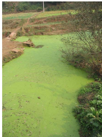
Algae lives on phosphates in the water (from detergents) and consumes the dissolved oxygen in the water.

result, can reduce the number and diversity of aquatic life forms over time (e.g. trout). Phosphate, a chemical compound in detergents, serves as “food” for algae. As a result, industry was forced to remove it from detergents.