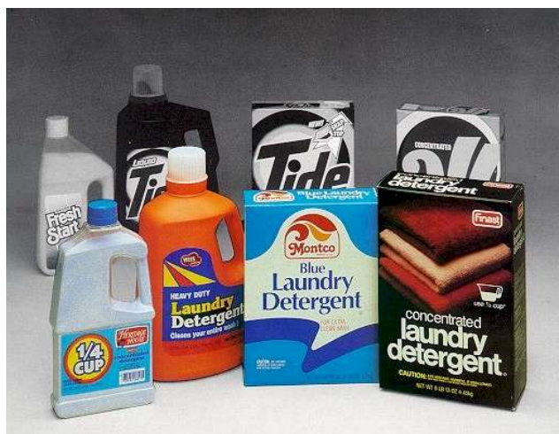
A selection of available laundry detergents.

Cleanliness is a very important aspect of living in today's world. Many people have become infatuated with cleanliness as a result of the various advertisements and television commercials that have been produced and broadcasted. Simply consider how many people change their clothes and shower several times each day. Such actions require the use of soaps and detergents, which explains why the manufacturing of such cleaning fluids has become a multi-billion dollar industry. Many people even have strict preferences in relation to soaps and detergents, which explains why there is such a large and complex selection made available to people in retail stores.