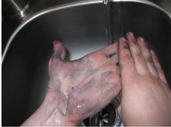
Cleaning snowmobile grease from your hands using soap and water is less problematic.

Soap, by chemical classification, is a surfactant. A surfactant is a material that can greatly reduce the surface tension of water.